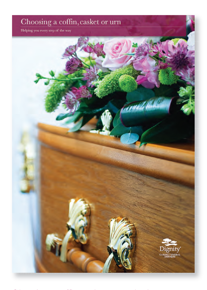
Choosing a coffin, casket or urn brochure

You will need to decide the type of coffin, casket, or urn you want. We have a brochure with a range of coffins, caskets and urns and we can discuss this with you when you make the arrangements.