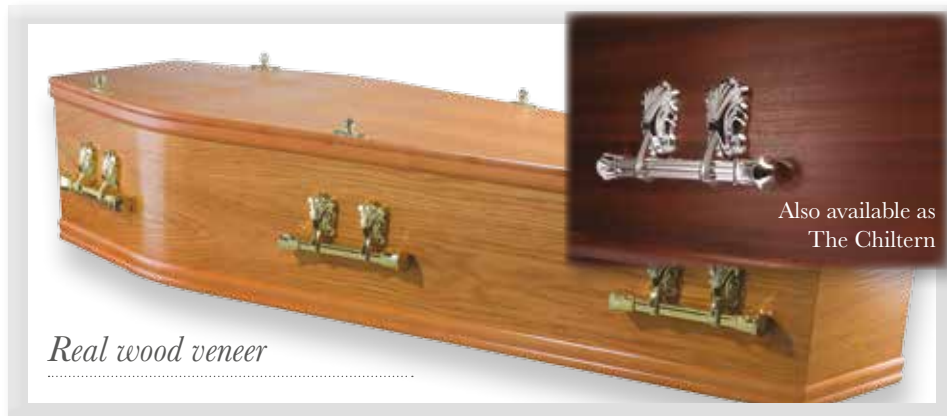
Real wood veneer

Also available in teak effect with brass effect handles as The Mendip.