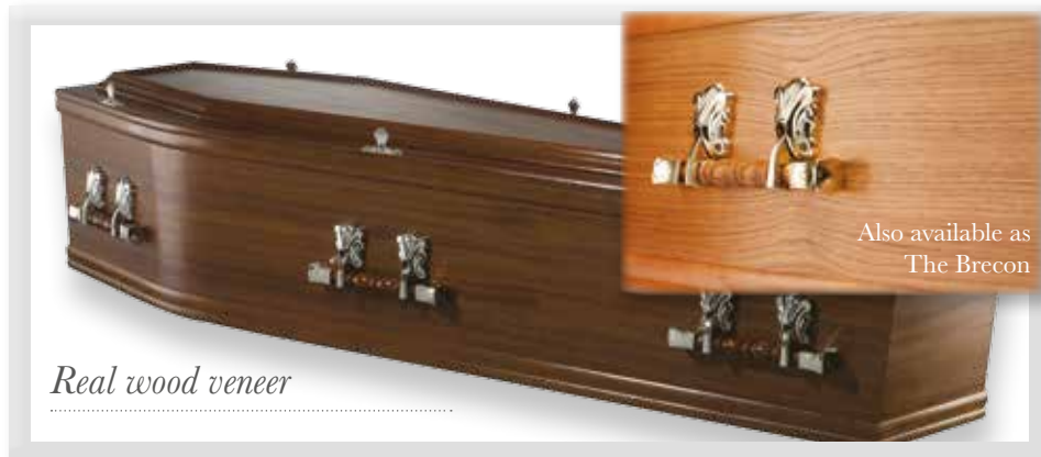
Real wood veneer

Also available in dark mahogany veneer with silver finish handles as The Chiltern.